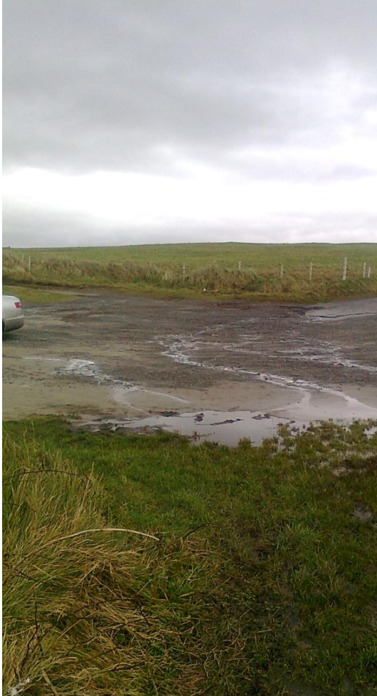
Dooley before maintenance works