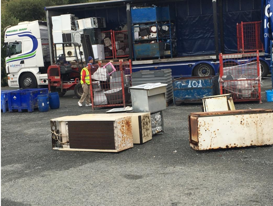
Carrigart WEEE Collection

Donegal County Council together with WEEE Ireland organised 7 free collection days of electrical goods throughout the County. A total of 40 tonnes of electrical goods were collected for recycling.