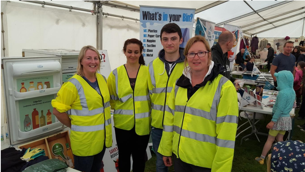
Waste Information Stand

Donegal County Council has been working with the Clonmany Agricultural Show committee on the first steps towards the "Greening" of the show. Litter control was identified as a priority together with improved waste segregation. Two large recycling stations were set up on the site for public and exhibitors use and all traders were informed on the morning about the new system. Show volunteers and Clonmany Tidy Towns and Council staff helped with monitoring the recycling stations and the litter control which made a very positive impact. Donegal County Council also had a Waste Information Stand which was busy throughout the day.